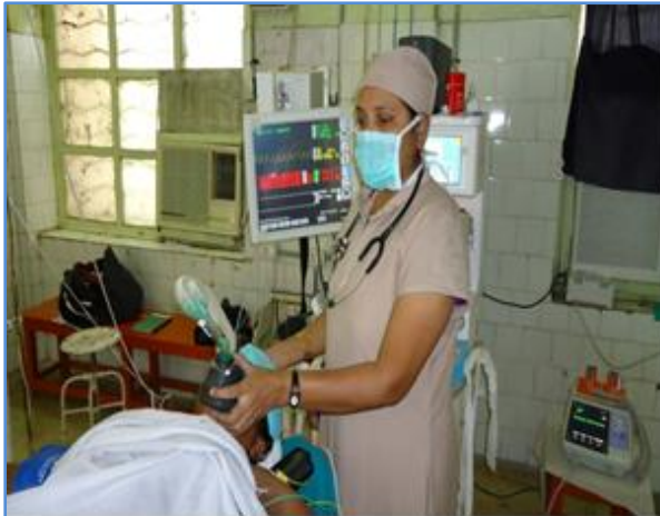
Figure 3: Before Surgery