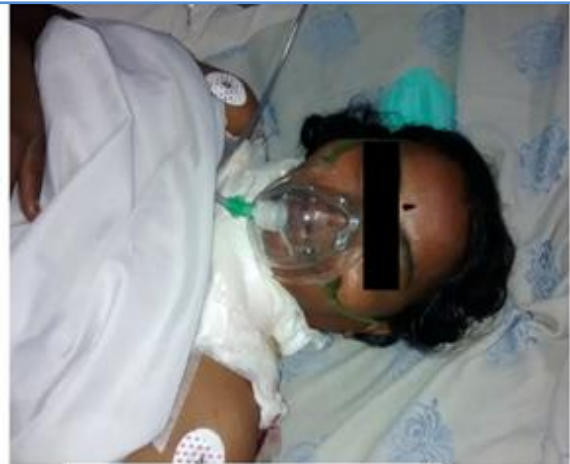
Figure 4: After Surgery